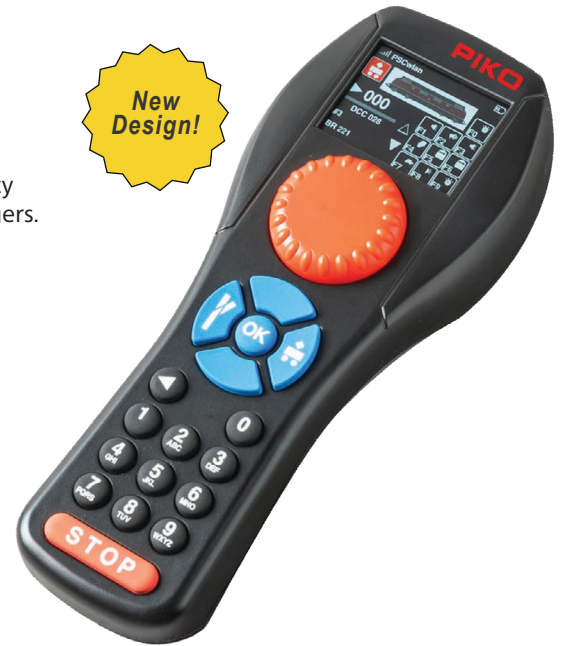
35051 PIKO G SmartController wlan Remote